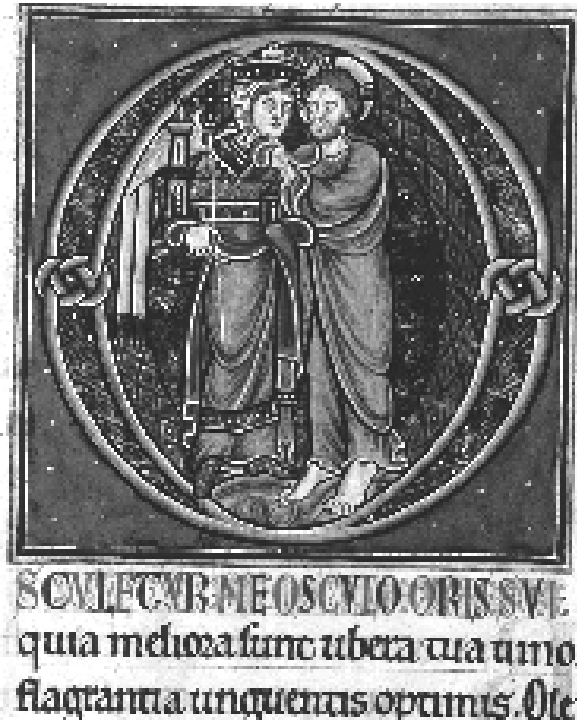
Fig.3: Paris, Bibl. Nat. ms. Lat. 16745, fol. 112v., Christ and the Church .

text itself - the Song of Songs. Certain verses and words from the poem do figure in the illustrations, however, and through them regain their original vital character: e.g. the scroll held by the Virgin in Santa Maria in Trastevere bears the verse of Canticles 2:6 and the presentation reflects this verse; and the word osculetur (Cant. 1:2) is presented both as a word and as an image, and thus achieves prominence as a pivotal element. Consequently, although the intimate relations depicted in the illuminations reveal the content of the commentaries, they also faithfully convey the spirit of the Song of Songs, which is preserved in these exegeses. The illustrations encircled as emblems within the letter "O" can be read as signs: 22 the kiss and the embrace are signs of God's grace.