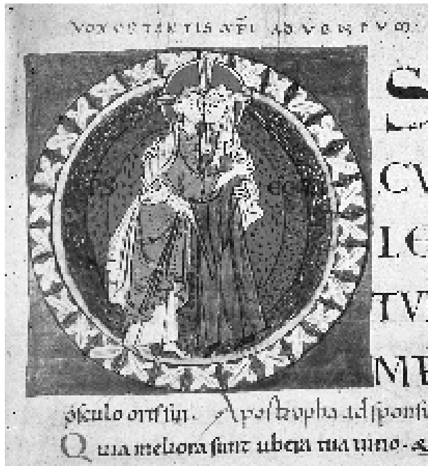
Fig. 2: Valenciennes, Bibl. Mun. ms. 10 fol. 1132., Christ and the Church .

Canticles 2:6: Christ is standing to the right of the crowned Virgin, with His right arm around her shoulder and His left hand under her chin. The Virgin holds a church in her hands as an attribute of her typology as Maria Ecclesia.