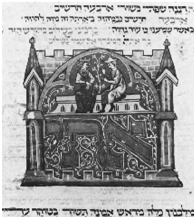
Fig.4: Leipzig Universitätsbibliothek, ms. 1102/1, fol. 46v., Initial word "אִתִּי"

The most frequent iconography is that of a noble couple, clad in rich garments. The man is in most cases a stereotypic figure, always wearing the pointed hat that indicates his Jewish origin. The woman in contrast is not stereotypical but differs in every illustration. Her beauty and noble status are always highlighted, but the attributes chosen by the artists for emphasis differ. These attributes are metaphors drawn from the poem, which the reader, who is familiar with the poem, can easily identify and for whom, well informed as to their exegetic meaning, they serve as signs. In most cases the couple is seated facing one another, with the man turning towards the lady in a gesture of speech, as if in dialogue. In contrast to the close and intimate relations depicted in Christian iconography, in Jewish presentations there is always a fair distance between the two figures. Sometimes this distance is emphasized by a flower -