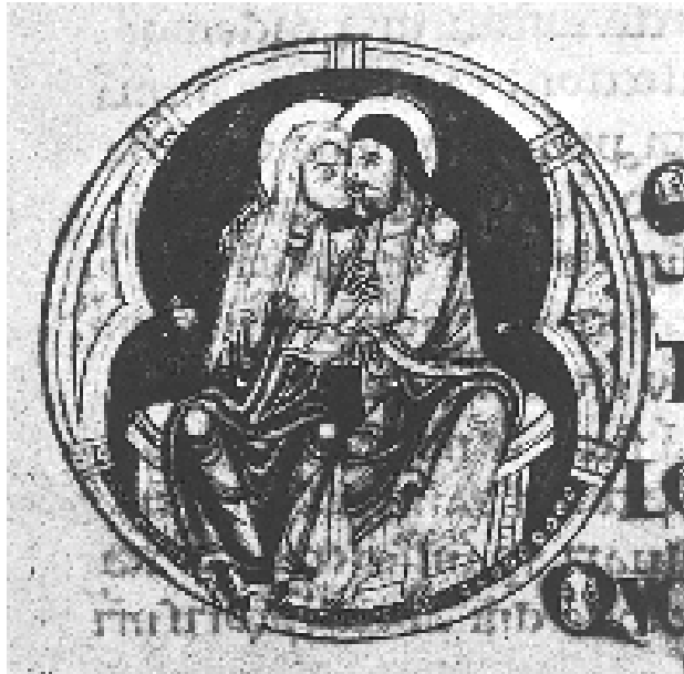
Fig. 1: Cambridge, King's College, ms. 19, fol. 21v. Christ and the Church.