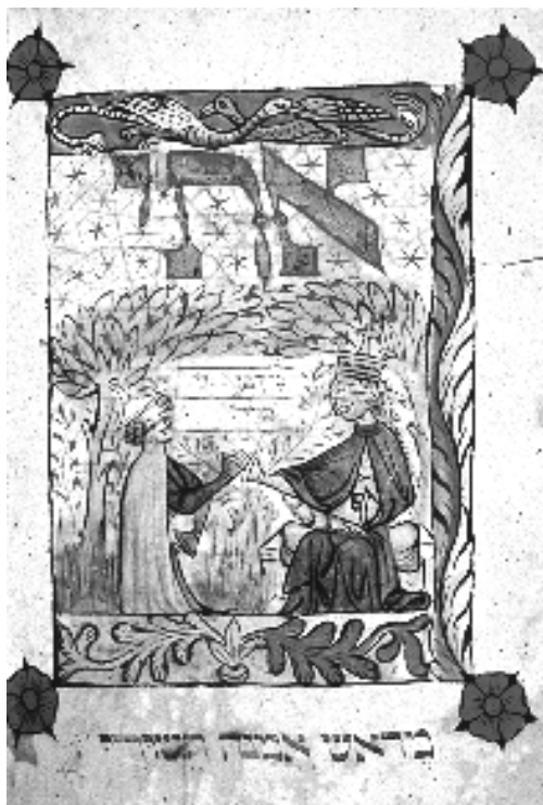
Fig.5: Hamburg, Levi 37, fol. 169v., Initial word "אתי"

as in the Mahzor from Leipzig; sometimes they are separated by the word "אתי" (with me)- as in the Laud Mahzor and the Mahzor from Darmstadt. This is not to imply that Jewish tradition totally forbids the depiction of intimate relations between historical characters - vide the illustrations of Jacob and Rachel. 24