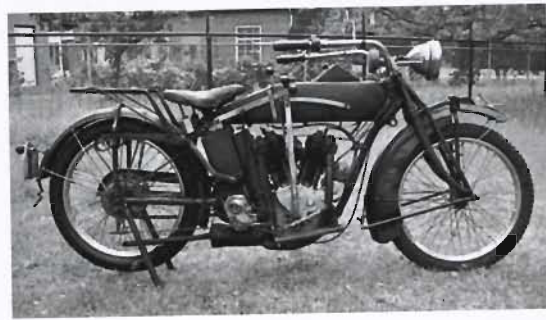
Above: The "type N.E. Indian motor cycle, 1917, Powerplus Twin Cylinder, cradle spring frame, three speed type with complete electrical equipment, including ammeter" used by the Coast Guard in Florida during World War I. The Coast Guard hoped this new technology would enable surfmen to patrol more areas quickly and to return to their posts with news of any sightings as fast as possible.

Although not substantiated in this instance, Wishaar's report appeared to validate the Navy Department's suspicions of at least the possibility that a belligerent power could build submarine bases in or near Mexico.